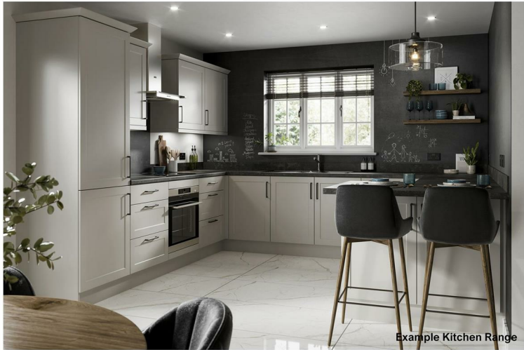
Example Kitchen Range

'The Willow' is an attractive three bedroom semi detached home complete with two allocated parking spaces and enclosed garden. Plot 16 of this exciting new development, 'The Nurseries' is located within the picturesque village of Kilham just 6 miles from the market town of Driffild. Being developed by Akkeri Homes, this property offers spacious and naturally light accommodation and will be completed to a high specification throughout. Charming and traditional in design The Willow will comprise entrance hall, cloakroom/w/c, bay windowed living room, separate dining/kitchen complete with a choice of kitchen units and quality integral appliances with the benefit of useful utility cupboard. Three bedrooms, master with En-suite and house bathroom. Externally the property benefits from two allocated parking spaces to the front and an impressive enclosed garden to the rear. Located on the edge of this sought after village with a variety of amenities to hand plus countryside walks on the doorstep and the East Yorkshire coast only a few miles away. With a limited number of 3 bedroom semi detached on this development, demand is sure to be high. RESERVATIONS being taken today!